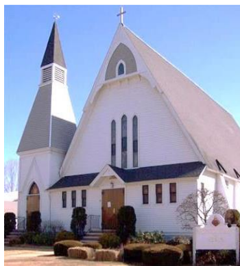
Sacred Heart of Jesus Church 22 West Main St. West Brookfield, MA 01585