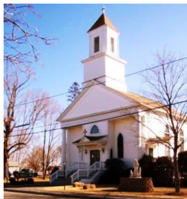
St. Mary Oratory 11 Lincoln St. Brookfield, MA 01506